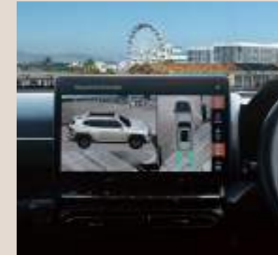
360° Panoramic View