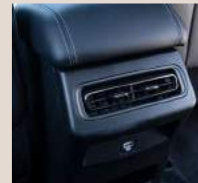
Second Row Air Outlet