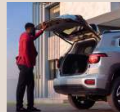
Hands-free Auto Electric Tailgate