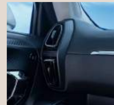
Dual Zone Air Conditioner