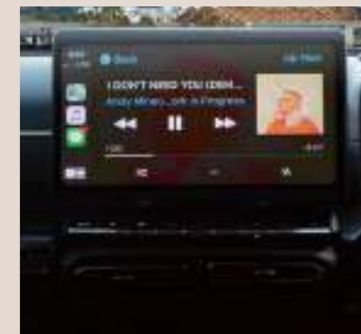
Apple CarPlay® & Android Auto

Model-specific features apply. Please refer to the specifications for details.