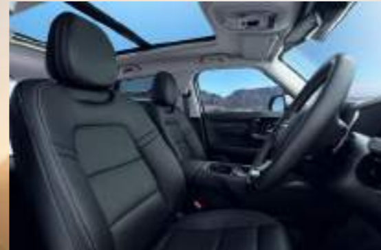
8-Way Power Adjustable Driver's Seat

The all-new H7 's interior is designed for ultimate comfort and versatility, with Leather Seats featuring Heating and Ventilation in the front row, rear seats that fold flat separately for added loading space, a Heated Multi-Function Steering Wheel and a Cooling Armrest .